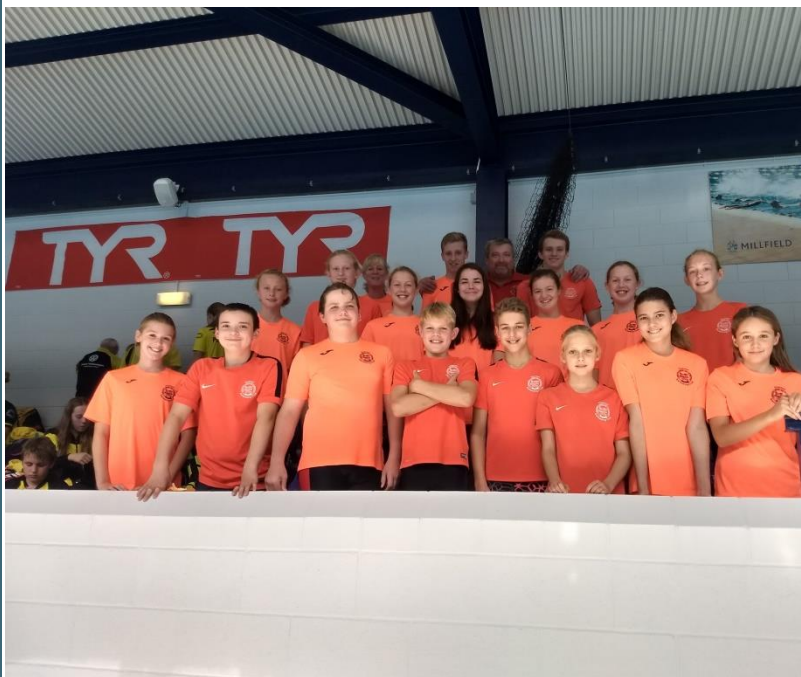
The relay teams on the balcony at Millfield.