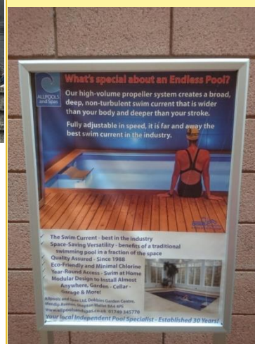
All Pools and Spa's Ltd

A huge thank you goes to both of our Sparkler event sponsors. This year we had two local businesses who sponsored our open meet. All Pools & Spa's and Ashfords who have very generously supported the 12th Tiverton Sparkler this year- THANK YOU!