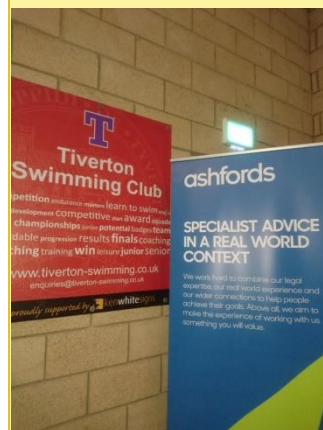
Ashfords LLP Solicitors