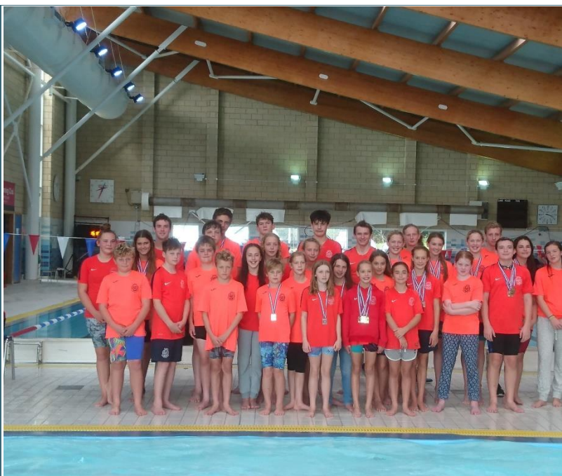
Super Sparkler swimmers photocall at EVLC on the day itself