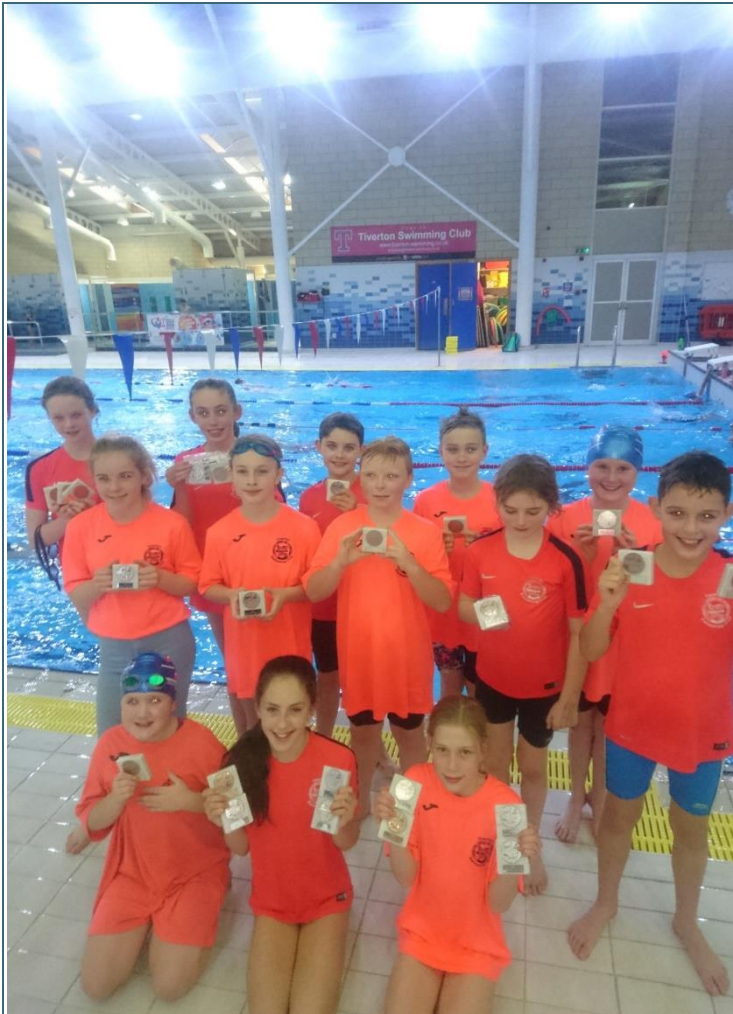
some of the CSA Flash award swimmers and their marble trophies