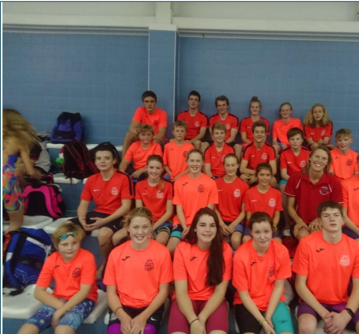
Swimmers at Newport pool (missing a few swimmers in this pic)

This meant that in round three of the Arena league we raced in the the finals gala for Division 2, which was held at Horfield pool in Bristol on Sat Dec 8th. The team had a fantastic time racing at this team event, with much face painting on the bus on the way up and a great team spirit meant they swam their hearts out to finish third in the final (out of the other 16 clubs competing) in the second division in the Western league. The unconfirmed points at the end of the 50 events were: Team Bath 359, Bristol Penguins 267, Tiverton 229, Dawlish 204, Llanelli 200, Yeovil 188, Chard 174, Kingsbridge 172.