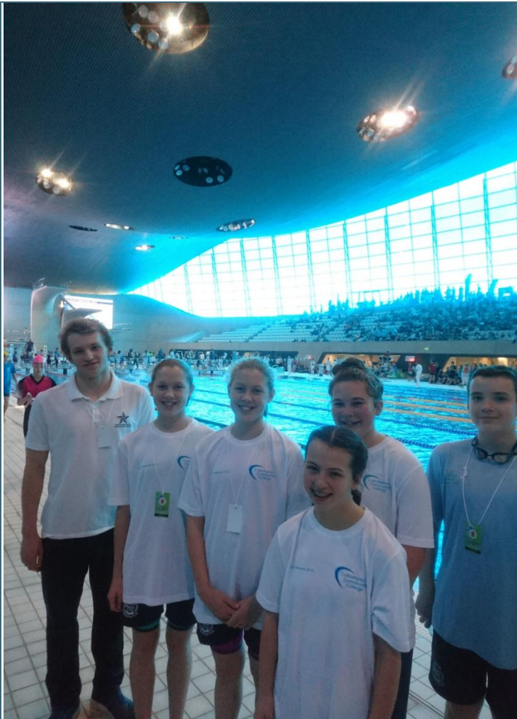
London Aquatic Centre pool for the ESSA team relay finals