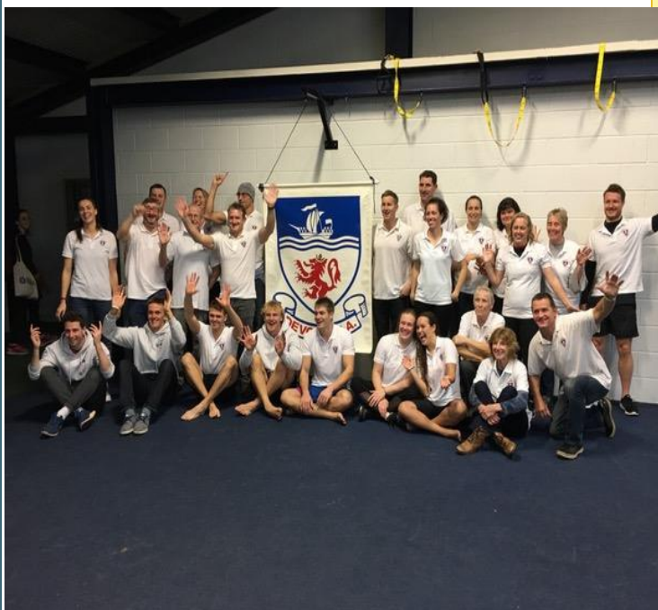
The Devon Masters Team at Millfield in Nov

Masters records for some of their team mates during races at Millfield!