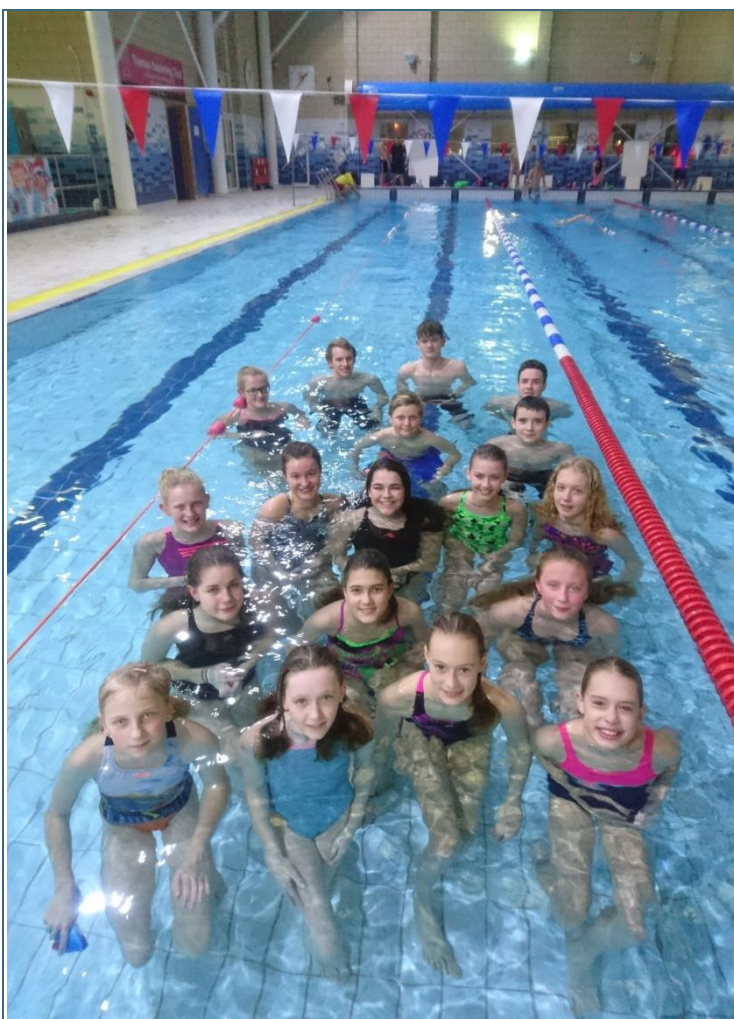
Some of the hub club meet swimmers photographed at EVLC pool (not all of them)