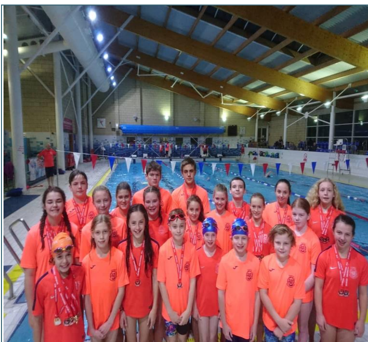
The Firecracker swimmers photographed at EVLC pool