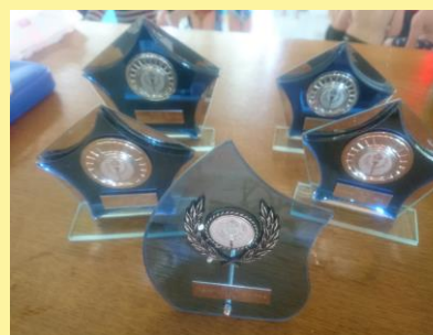
Trophies won last year at JT Gala