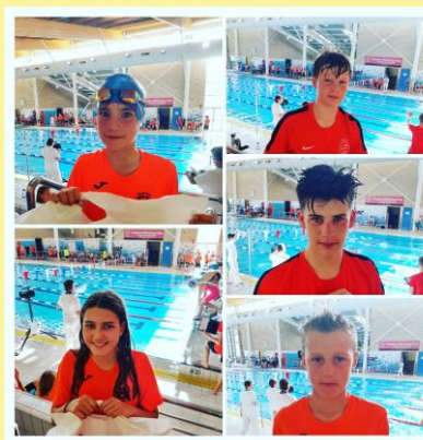
Session One Winners June 30th 2019

goody bag for being the fastest swimmer in their heat when the claxon sounded!!