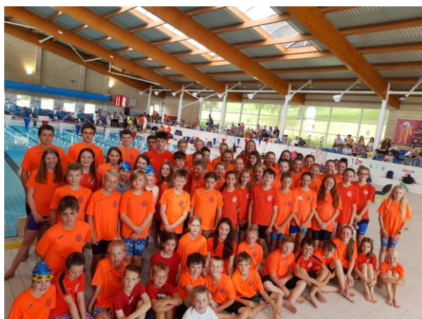
Club Championships 2019 at EVLC

A huge thank you to all of the parent volunteers and club officials who stepped up and ran this meet- there were 45 of you who all made the event run like clockwork- we cant do it without you!