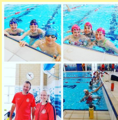
Using the Jukes in the pool!