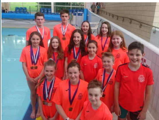
Nineteen swimmers from Tiverton Swimming

www.easyfundraising.org.uk/tivertonswimmingclub