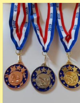
Club Champs Medals 2019